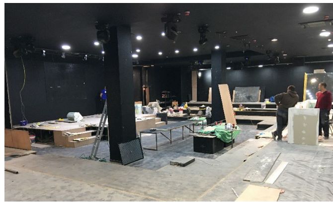
Finishing new Church in Haifa

Right now, over the Easter and Passover weekend the country is on total lockdown. Their main outreach is built on Rehab Centers and new arrived Immigrants. The Coffee House/feeding Center in Tel Aviv is closed as is most everything else. There are 138 persons in Rehab including staff in all our Centers and this was a self-supporting ministry until all the patients lost their jobs( all go to work after the first 6 weeks of rehab) So we’re trying to help them over the next 3-4 months, $3.00 a day X 138 is still $12,000 a month.