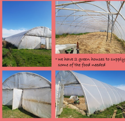
• we have 2 green houses to supply some of the food needed