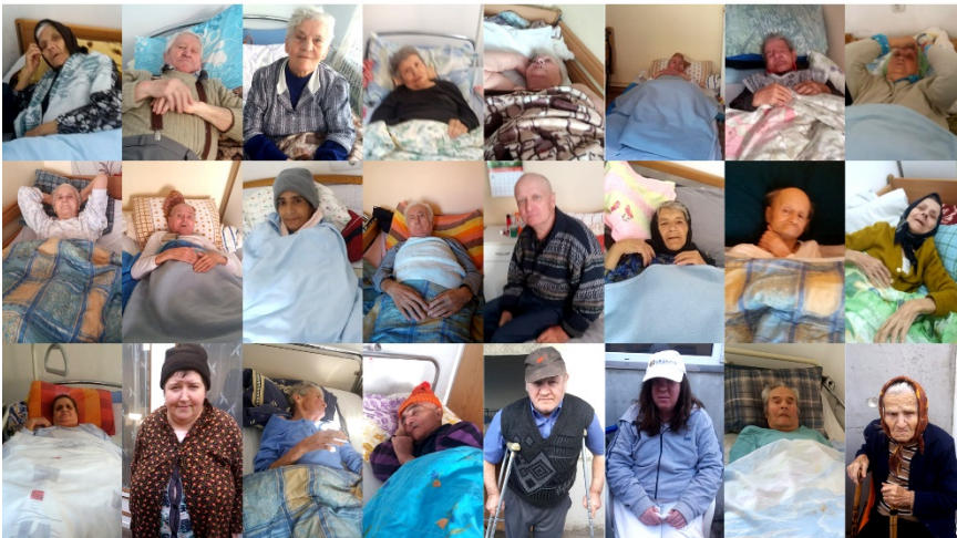
Peniel Elderly Nursing Home is part of PH Romania