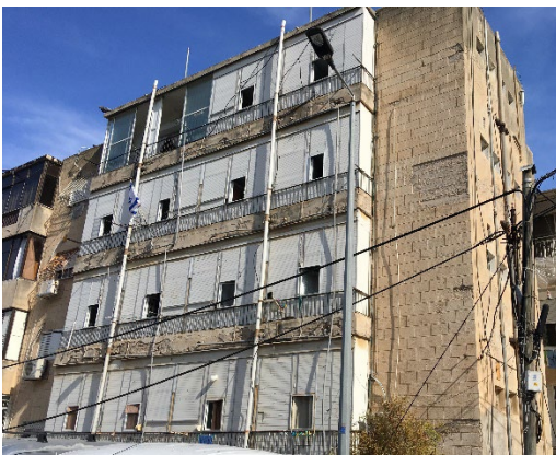
One of the Rehab Centers in Haifa

ISRAEL: What a happening place. My travels to there in November gave me an even better overview of this great ministry of IPHC Living Israel. It is the fastest growing network of Churches with 32 locations, throughout the country. In November we had just acquired a super location in Haifa to facilitate all the house Churches in that region. The building “was” going to be a high-end Gentlemen’s club and the government shut it down before it even opened. It is now a Church that can hold 450-500 persons. All the sound and expensive lighting was already installed, and Living Israel negotiated for all those items in their lease. So just as they were ready to open, Israel closed all places of public gathering.